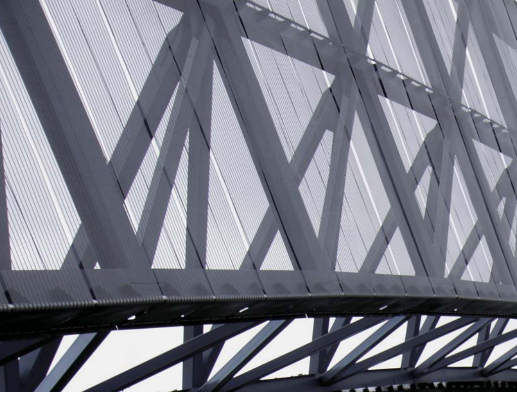
New Holmenkollen HS134, Windscreen.