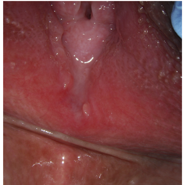
Fig. 3. This photograph of the genital area of a 12-year-old girl shows a shallow groove in the fossa in the midline. This feature is commonly seen in girls in the early stages of pubertal development. The small fleshy protrusions along the sides of the groove are normal vestibular papillae, which should not be mistaken for signs of injury.

In this study, vaginal samples were positive for HPV in 37.9% of the patients. The prevalence of infection was 47.4% in the sexually active adolescents, 28.6% in the non-sexually active adolescents, and 34.5% in the prepubertal girls. The authors concluded that: “Because HPV genital infection before sexual debut seems to be more common than was previously thought, clinicians should be very careful when suspecting sexual abuse only on the basis of positive HPV testing.” The relationship between a positive clinical test and clinical disease remains to be clarified. This high rate of positive tests in sexually active as well as non-sexually active adolescents and children is an issue worthy of