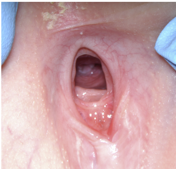
Fig. 5. This is a photograph of the same child as in Figure 4. She has been placed in the prone knee-chest position, kneeling on the examination table with her buttocks elevated, so her anus would be at the top of the photograph. The hymen has a more thinned out appearance, but the edges are smooth, and there are no notches or other signs of past injury. Without magnification, it might appear to an inexperienced clinician that there was no hymen, but it is present around the whole opening. This examination does not show any signs of past injury or abuse.

The finding of a deep notch/cleft in the hymen at or below 3 and 9 o’clock is listed in the “No expert consensus/findings inconclusive for abuse” section of Table 1, because this is a rare finding that has been reported in a few prepubertal 20 and pubertal patients 21 with a history of sexual abuse, or consensual intercourse. 22 However, current studies do not show a consistent pattern of whether lacerations of the hymen heal 23 to a transection, a deep notch, or a nonspecific finding. Complete clefts/healed transections