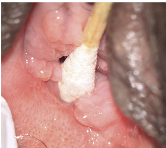
Fig. 2. This is the same patient as shown in Fig. 1. A cotton swab is being used to demonstrate the absence of hymen between 6 and 8 o'clock, confirming the presence of a hymen transection. This finding is considered to be a definitive sign of past injury to the hymen, which was torn through to the base of the hymen.

Photo documentation of all examinations has many advantages. Regular review of examination findings with a provider with expertise in child sexual abuse provides an opportunity for team members to learn from more experienced examiners about the variable appearance of normal genital and anal anatomic features. For example, a groove in the mid fossa (Fig. 3; item 9a in Table 1) is a normal midline anatomic feature typically seen in pubertal female adolescents. The appearance of the hymenal rim might change with examination position or technique; Figures 4 and 5