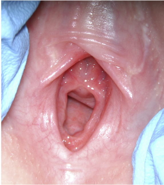
Fig. 4. This photograph shows the genital tissues of a 5-year-old girl examined in the supine position, using labial separation. She was brought for a sexual abuse evaluation several weeks after an event she described as “He put his private in my private, in the front.” There are no signs of acute injury. The labia minora are short, which is typical of the appearance in a prepubertal girl. There is hymen tissue all the way around the hymen opening.

Should the known or suspected offender in the child’s case have serologic testing done for HSV? It is doubtful that such testing would be helpful in most situations. The most commonly used serologic test for type-specific antibodies to HSV is HerpeSelect-2 EIA (Focus Technologies, Cypress, CA). If the child’s genital or anal lesions were caused by HSV type